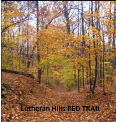
Lutheran Hills RED TRAIL

An adventure week based at Lutheran Hills that involves day hikes on the Tecumseh Trail, a premiere Indiana hiking trail that skirts the Lutheran Hills property, and 2 days of caving in southern Indiana. The program is not designed as a serious athletic challenge. The focus is FUN! Cost is $395.