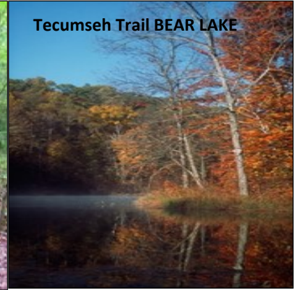
Tecumseh Trail BEAR LAKE

Monday — A day exploring sections of the 7-mile Lutheran Hills trail system including trail highlights Geode Creek, Buckeye Mountain & Trinity Point. We hike the Blue Trail in the morning, have lunch back at the camp dining hall, then hike the Red and Green Trails in the afternoon. Total hiking mileage for the day is 4.5 miles.