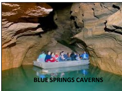
BLUE SPRINGS CAVERNS

Thursday — After breakfast we'll travel to Marengo Cave (Marengo IN) for two cave adventures—a walking trip before lunch and a cave "crawl" in the afternoon. We'll head back to Lutheran Hills for a late dinner.